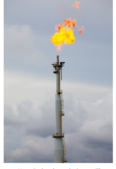
New Federal regulations will require most flares to monitor BTU and many to measure hydrocarbon composition.

In addition to meeting regulatory needs, the rapid and accurate composition measurement of the Verax system can provide valuable insight into process conditions upstream of the flare. The ability to monitor process changes at the flare can accelerate identification of issues, saving valuable time and money. For just one example, if a valve is leaking to the flare, the Verax displays the compositional change, allowing operators to identify the source: if an increase in butane is indicated, operators can investigate butane-rich processes—instead of looking across the entire plant.