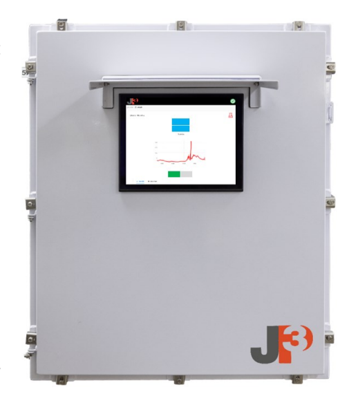
Verax NIR Analyzer: The ideal solution for simultaneous monitoring of BTU and hydrocarbon composition.